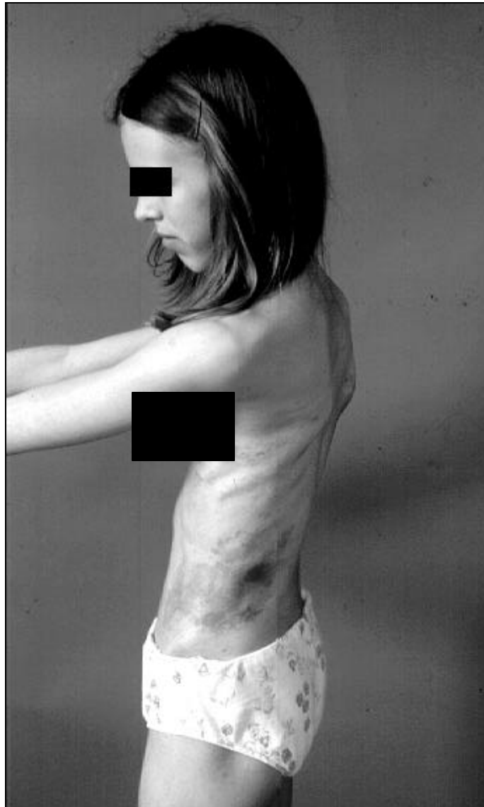
Figure 8. Severe atopic dermatitis developed on the trunk of this girl.

The vital capacity may be temporarily reduced in patients treated with the Wilmington brace, therefore the orthosis is not recommended for patients with severe respiratory insufficiency. As previously reported from this Institution, 26 patients undergoing brace treatment had their vital capacity reduced by an average of 18 per cent when wearing the brace compared to their vital capacity when the brace was not worn. Further, no negative effects to the pulmonary function were found to occur in patients undergoing long-term treatment of greater than three years 5 .