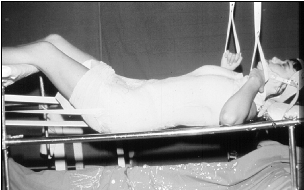
Figure 2. Application of Risser cast, with longitudinal traction in place.

To fabricate the Wilmington brace it is necessary to provide a positive mold (plug) such that the thermoplastic material may be shaped around a rigid and exact form. To make the positive mold a Cotrel or Risser type cast is applied (negative mold) with the patient in supine position on a cast table. At the time of application of the cast, both longitudinal and transverse reduction forces are applied with the goal of achieving as much clinically observed improvement of the deformity alignment as possible 4 . Longitudinal traction is applied by a head halter and a pelvic halter (Fig.2).