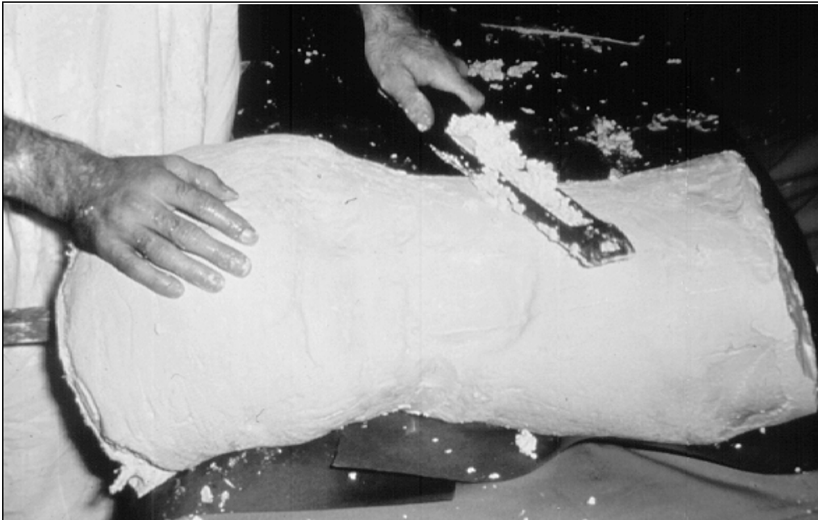
Figure 3. Modification of the positive mold (plug).

The transverse reduction forces are applied by Cotrel straps or by hand pressure in the Risser cast. With the patient in the cast, a roentgenogram is made to determine the amount of reduction of the curve and the degree of improvement of the alignment and balance. If the correction is adequate, the cast is removed from the patient and then filled with plaster to provide the positive mold. The positive molds may be further modified to refine the positioning of the reduction forces and eliminate areas, which produce pressure points (Fig. 3).