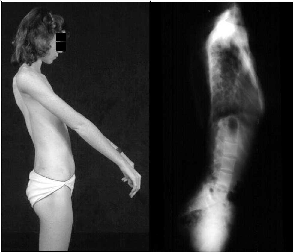
Figure 6. Severe thoracic lordosis should not be treated in a thoraco-lumbo-sacral orthosis

The reduction molds in the brace may exert posterior forces on the spine and exaggerate the lordosis. In patients with lordosis, the reduction molds can be placed laterally; however, the brace should be used with caution.