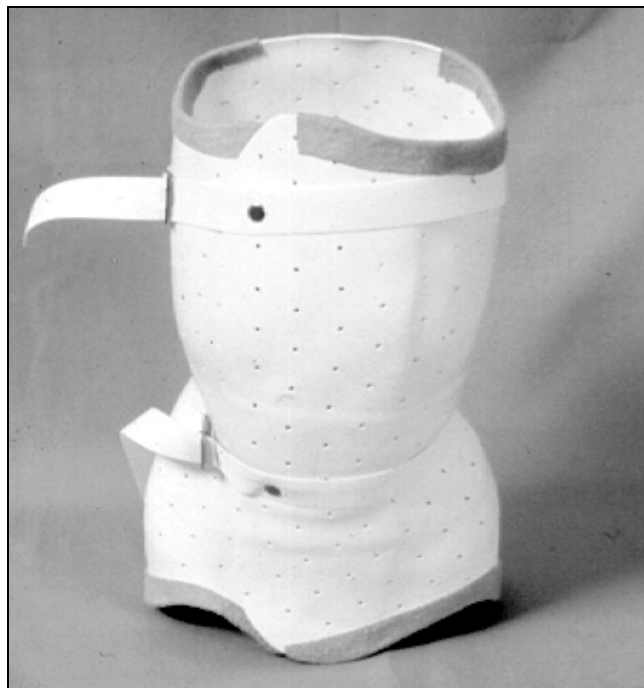
Figure 1. The Wilmington Brace is a lightweight thorac-lumbo-sacral orthoses with adjustable straps.

The Wilmington Brace is a custom-made plastic underarm thoraco-lumbo-sacral orthosis used for the non-operative treatment of idiopathic scoliosis and certain other spinal disorders. The brace is a total-contact orthosis and is fabricated from one of several plastics with the most common being Orthoplast. The brace is designed as a body jacket, which opens in the front for easy removal and is held closed by adjustable Velcro straps. The top trim lines are established to fit high in axillae and the inferior trim lines are at the levels of the greater trochanters and the pubic symphysis. Corrective molds are fabricated into the plastic of the body jacket for correction of the spinal deformity. Since the brace is thin it can be hidden under the clothing. (Fig. 1)