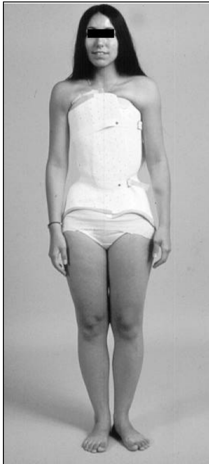
Figure 4. A well fit brace with trim lines at the level of the greater trochanters and the pubic symphysis inferiorly, and the superior aspect of the brace is trimmed to fit high in the axillae.

Some advantages of the Wilmington Brace are the time of fabrication is considered to be about 50% less than the Milwaukee brace and the cost averages about 40% less than the Milwaukee brace. At the Alfred I. duPont Institute, most patients can receive the finished brace on the same day of the casting.