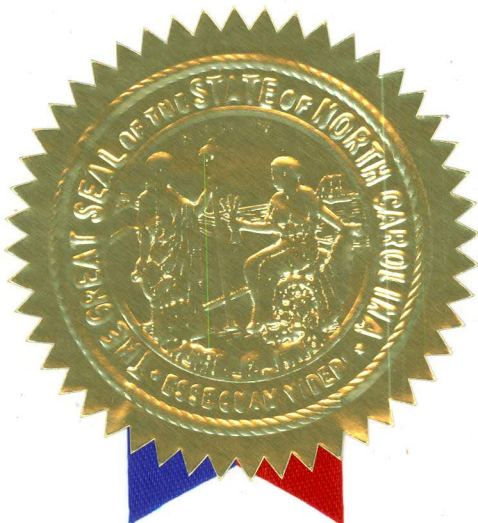
BEVERLY EAVES PERDUE

NOW, THEREFORE, I, BEVERLY EAVES PERDUE, Governor of the State of North Carolina, do hereby proclaim June 2012, as "SCOLIOSIS AWARENESS MONTH" in North Carolina, and commend its observance to all citizens.